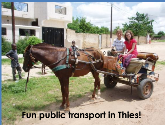
Fun public transport in Thiès!